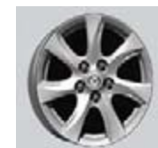
16" alloy wheels (GS)