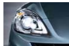
GUNMETAL BLUE MICA