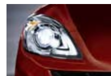
COPPER RED MICA