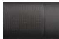
BLACK CLOTH (GS & GT)