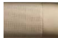
DUNE BEIGE/BLACK CLOTH