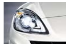
CRYSTAL WHITE PEARL