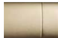
DUNE BEIGE LEATHER