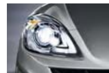
ALUMINUM METALLIC MICA