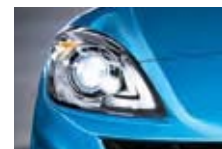
CELESTIAL BLUE MICA