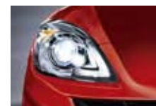
VELOCITY RED MICA