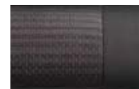
BLACK CLOTH (GX)