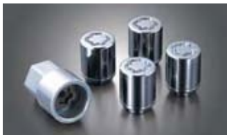
Wheel locks - Chrome (set of four)