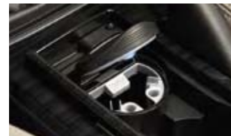
Ashtray (cup type with LED illumination)