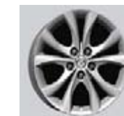
17" alloy wheels (GT)

MAZDA WARRANTY The basic warranty on the MAZDA3 and MAZDA3 Sport covers all parts found to be factory defective for 3 years or 80,000 km, whichever comes first. Additional warranties cover powertrain components for a period of 5 years or 100,000 km, whichever comes first, body sheet metal perforation for 5 years and unlimited mileage and specific emission control components for up to 8 years or 128,000 km. Exclusions from coverage are limited to maintenance items or adjustments (repairs not requiring parts replacement) on vehicles over 12 months old and repairs due to normal wear and tear. Ask your Mazda Dealer for additional information.