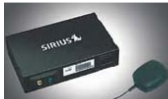
SIRIUS Satellite Radio